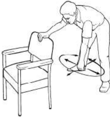
Exercise 1 of 4