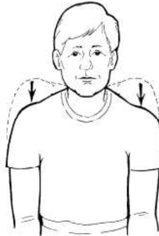
Exercise 2 of 4